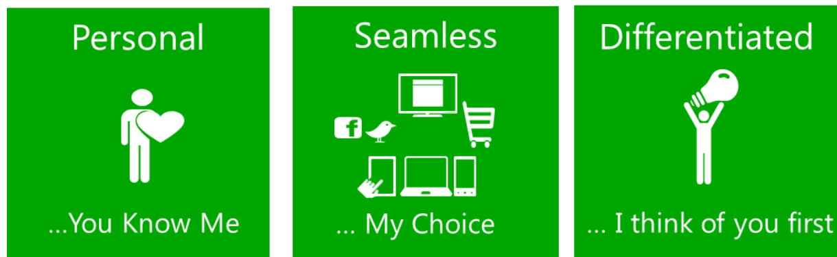
Graphic 2: The Complete Shopping Experience

Differentiated. “The retailer makes it easy for me to get what I want at a good price. Their people are helpful and efficient—they provide excellent customer service. They consistently do a better job than other stores where I shop. I have the best overall experience here.”